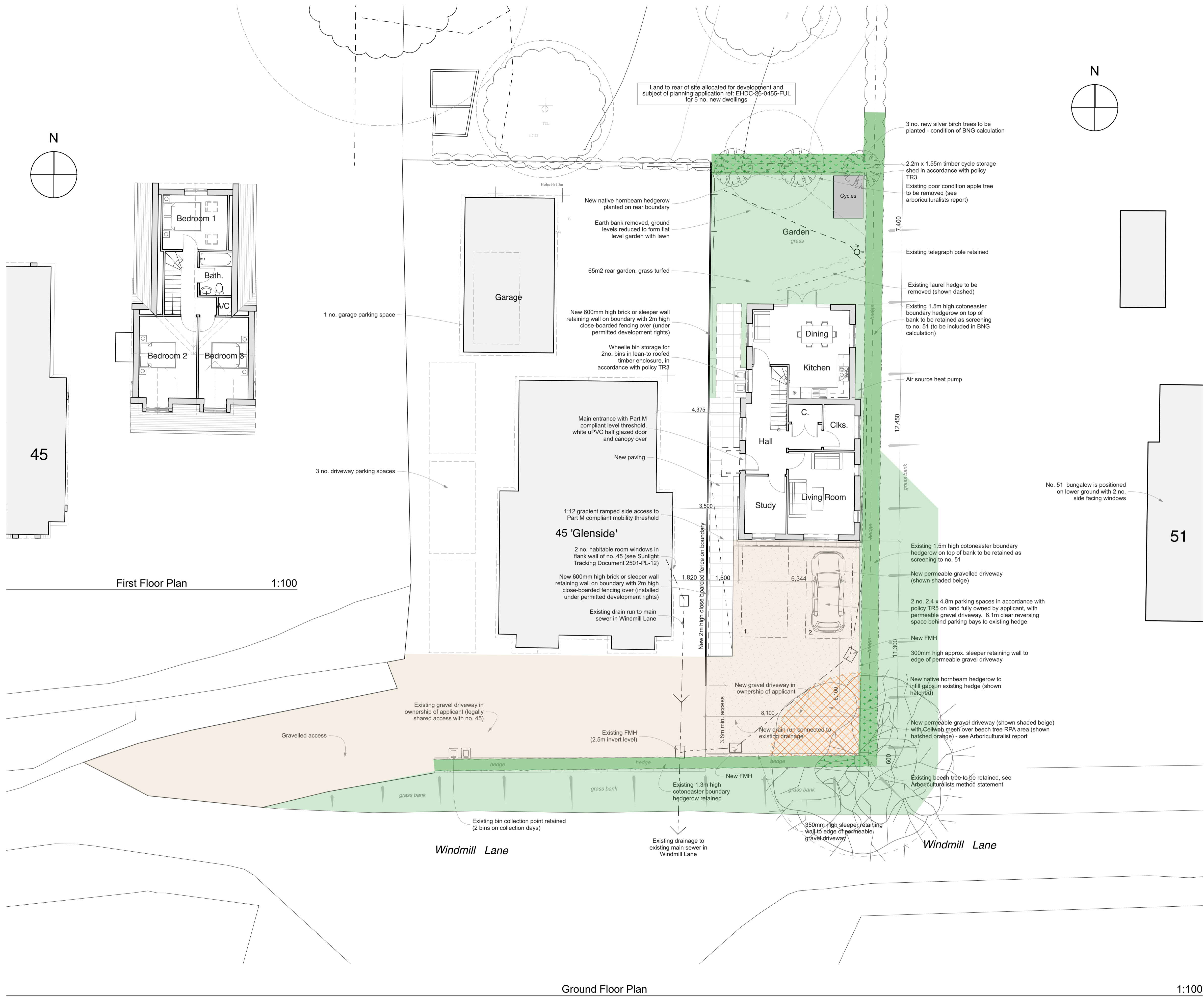
First Floor Plan 1:100