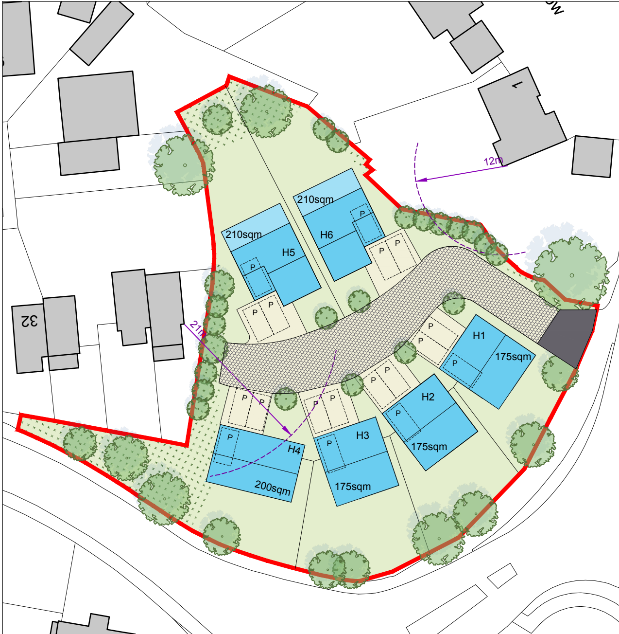
Sketch Proposals - Option 9b Scale: 1:500