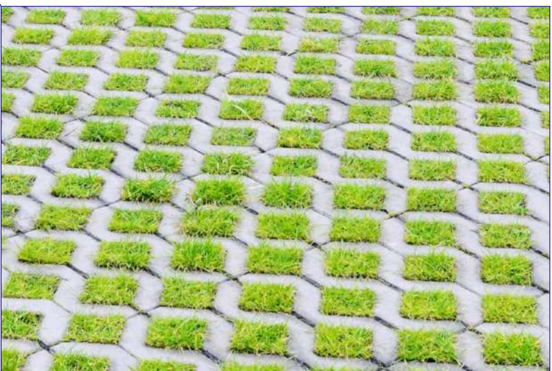
Grasscrete to all parking areas