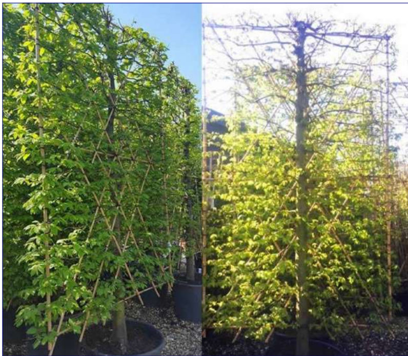
Living Screening consisting evergreen pleached Laurus Nobilis, Bay Trees and deciduous Carpinus Betulas to be planted along Northern Boundary of Buffer Zone to further reduce any concerns of overlooking from Neighbouring Properties. Height grow to vary between 6-11ft.