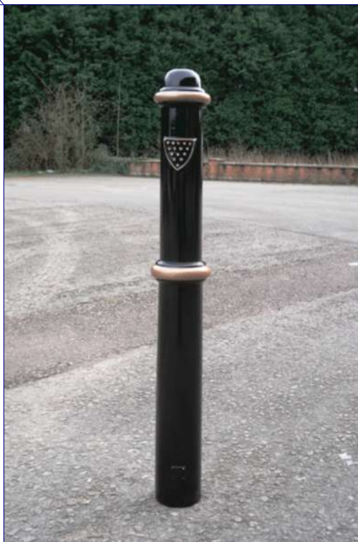
"Cornish Symbol" Parking Bollards to eradicate illegally parking on pathways