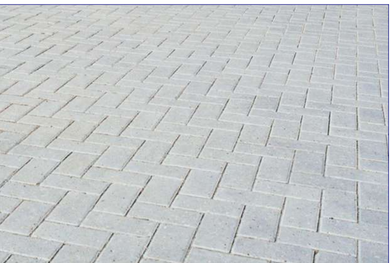
Permeable Brick Paving to all footpaths