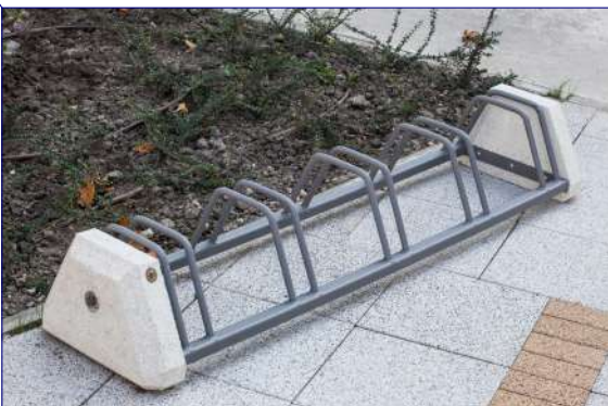
Bike rack for customers