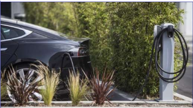
Electric car charging points