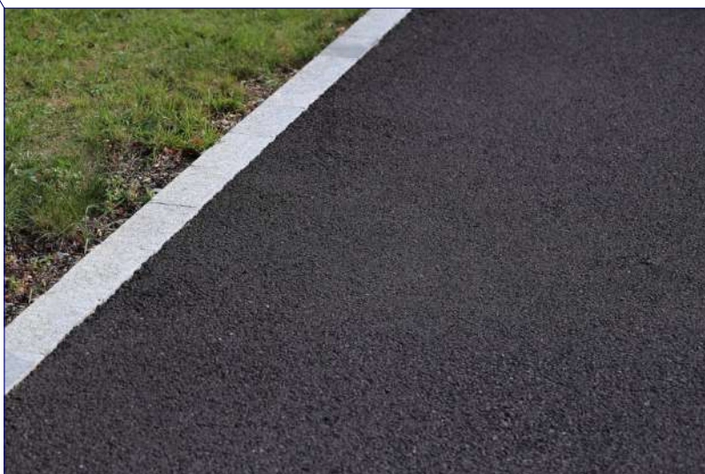
Tarmac to all highways