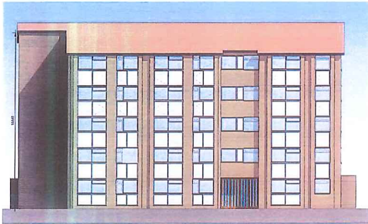
① Elevation 1 - a 1 : 100