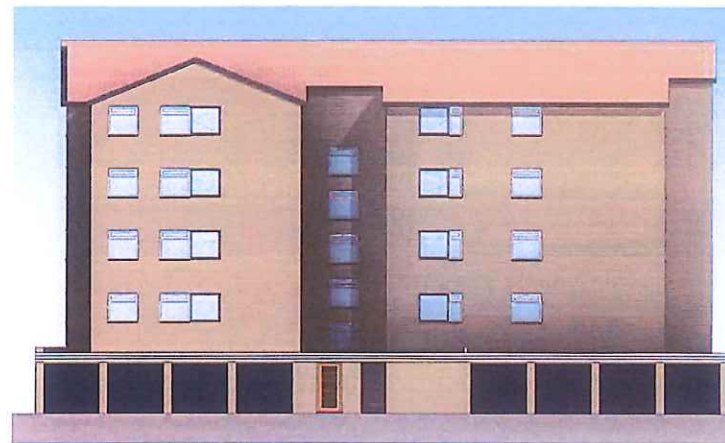
④ Elevation 4 - a 1 : 100