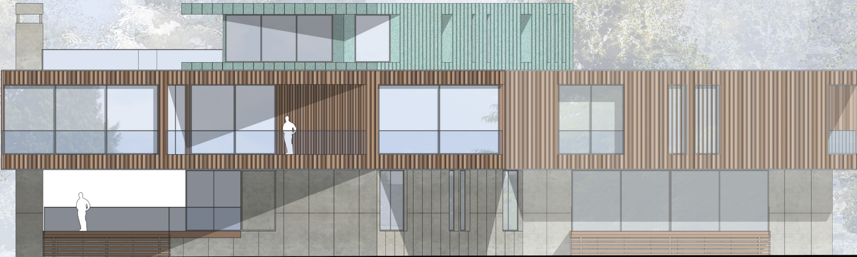
South West Facing Elevation