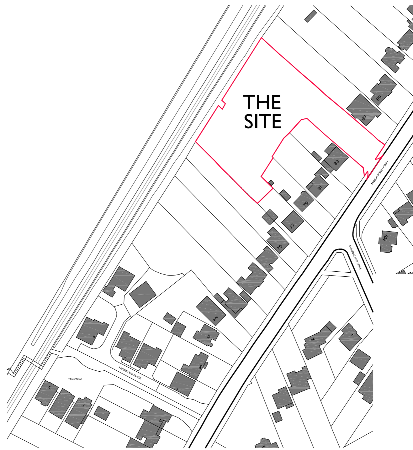
SITE LOCATION PLAN (Scale: 1-1250)